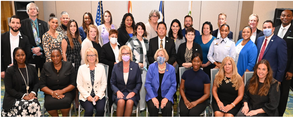
Graduates of the Protocol School of Washington ® Miami, Florida Class of 2021.